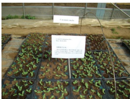
Photo 1. Obtaining melon seedlings in alveolar trays filled with peat substratum (original)