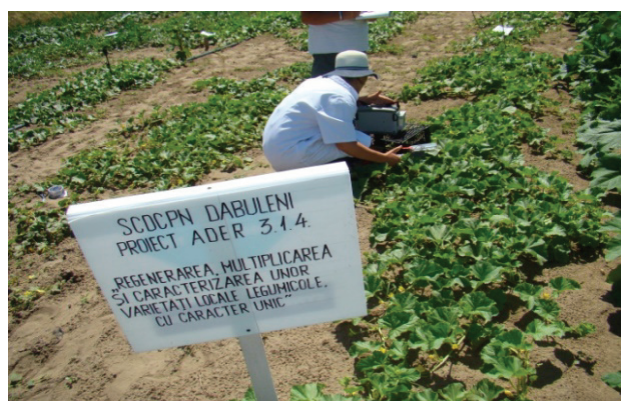
Photo 2. Physiological determinations with LC Pro + Portable Photosynthesis Device (original)

The research on the physiology of the plant at the 18 genotypes of melon grown in the sandy soil area of Dabuleni aimed to determine their tolerance to the thermo-hydric stress characteristic to the area. Taking into account the primary role in the formation of photosynthesis products, light is considered the main environmental factor influencing the photosynthesis process. Analyzing the diurnal variation of photosynthesis, depending on the intensity of active radiation, during the blooming phase, a positive correlation is found, which emphasizes the increase of CO 2 absorption through photosynthesis up to an active radiation value of 1,800-1,815 μmol / m 2 / s (Table 3).