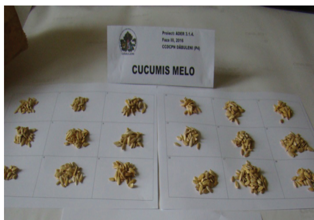
Photo 5. Seeds obtained from different melon genotypes (original).